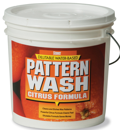
Item # B251

Customers worldwide use this heavy duty, fast acting formula to remove oils, greases and mold release film from molded wax patterns. Customers appreciate the ability and flexibility to use straight or diluted as much as 1:1 with excellent results.