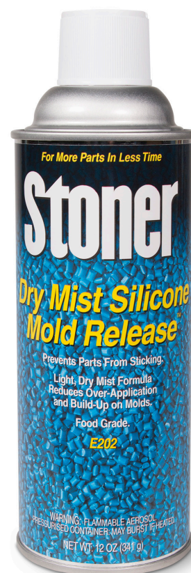
Item # E202

Investment casting molders worldwide find Stoner's unique ability to formulate and manufacture helps them save time and money. A consistent and reliable spray pattern ensures part-to-part integrity - more high quality patterns in less time.