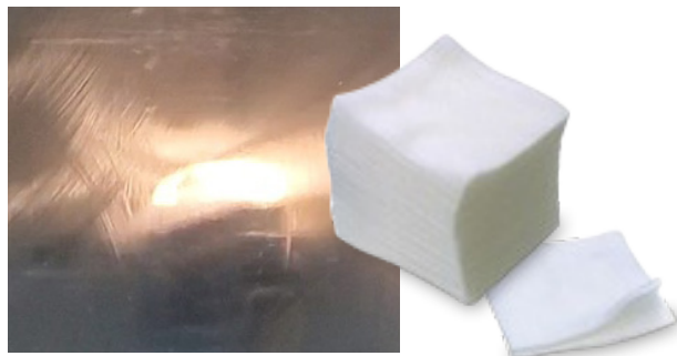
Unsatisfactory removal using polyester wipe