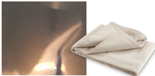
Unsatisfactory removal using cotton cloth